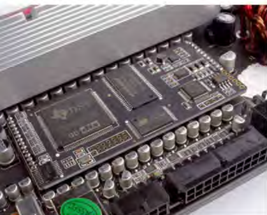
The DSP board contains the large TI DSP, the controller and two memory chips