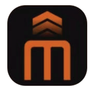
Firmware Updates via Musway OTA APP