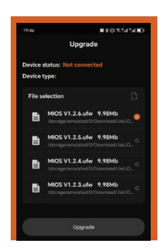
Unlock exciting new features for future needs