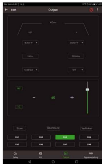
The crossovers can also be set with the app, as well as runtime, level etc.