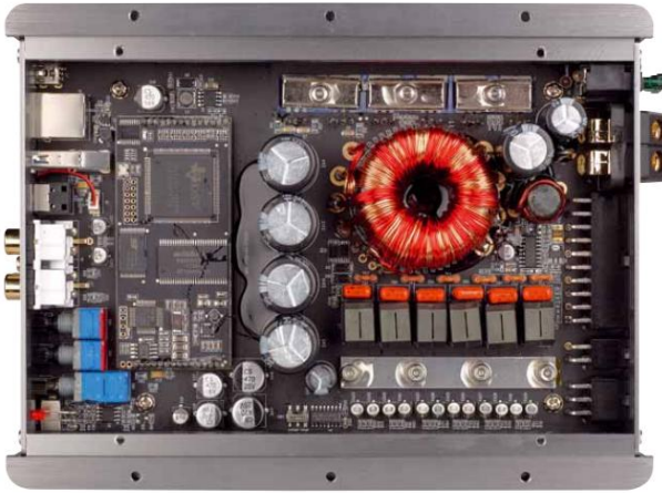
The 6 channels are amplified with 3 chips. The DSP sits with controller and memory on an additional board