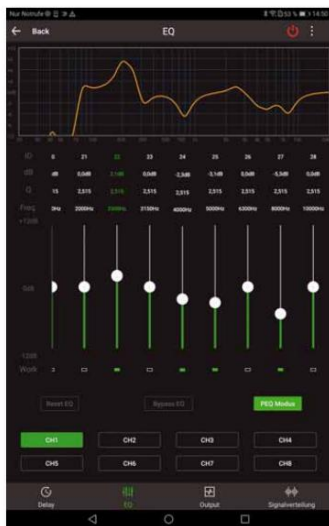
The app offers almost full functionality, here with equalizers and frequency response

Thus, the M6 is much more than just an upgrade solution for a cheap factory sound. At around 0.2%, the THD is not sensationally low, but low enough to hear good music. This is also evident in the hearing test, where the M6 looks grown up. It sounds really good, and not just for a mini amp. The M6 makes a powerful bass, performs nice voices and sounds good and round overall. The sound is good enough in all circumstances and makes even the most demanding listeners happy.